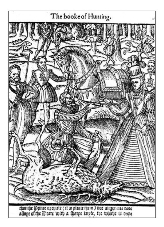
[A 16<sup>th</sup> century hunt]